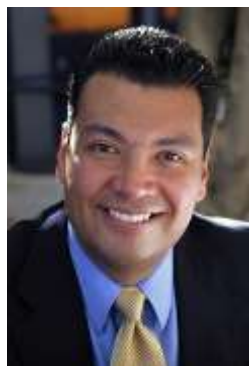
Honorable Alex Padilla California Secretary of State

Six years after the landmark Supreme Court ruling in the Citizens United case, the nationally-recognized experts at this forum will cover a range of topics associated with big money in politics and government efforts to ensure transparency and prevent the appearance of corruption.