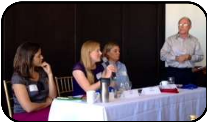
Climate Change Luncheon Panel